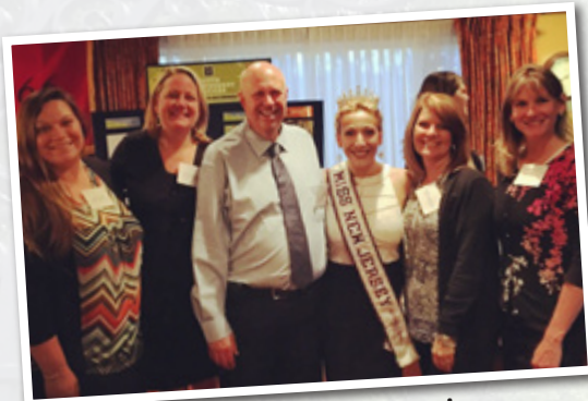
Supporting Youth Empowerment Services of New Brunswick's Fund Raiser

RFCU - Serving the RU Community All Year