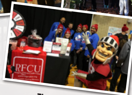
The Big Chill