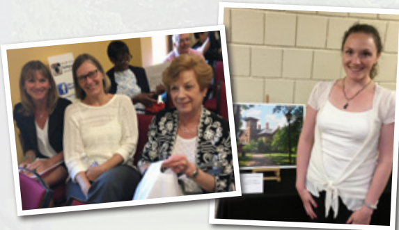
RFCU's Annual Meeting