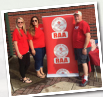
RAA's day at the Trenton Thunder