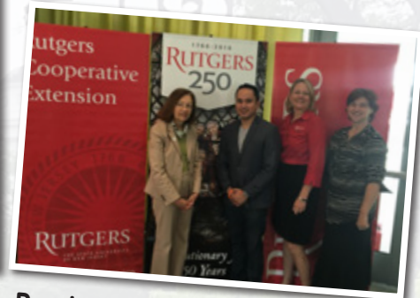
Panel speakers for Road to Financial Wellness 2.0