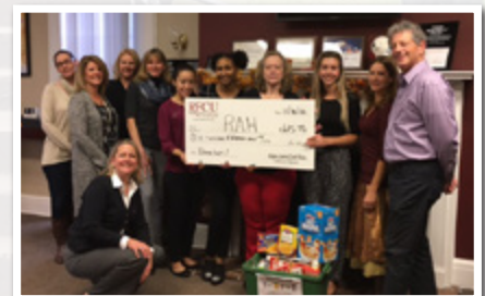
Rutgers Against Hunger Annual Fund Raiser